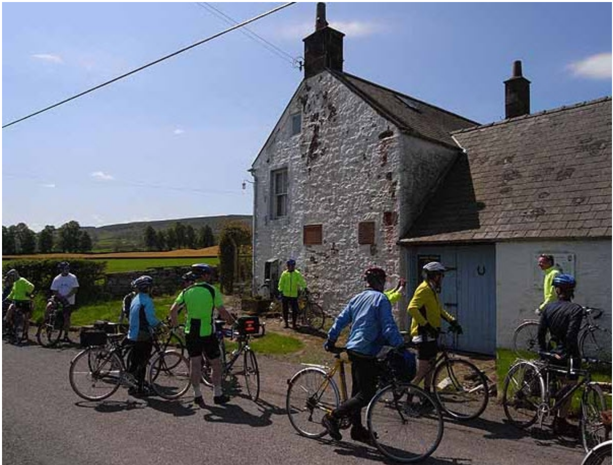
Cyclists paying homage – The Courthill Smiddy – Keir Parish, Dumfries and Galloway